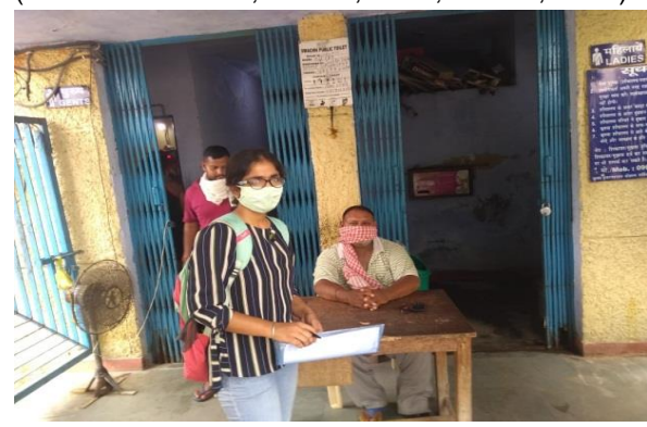
Figure 5. Swacch Public Toilet opposite MCF Office in Ward no. 15

2020). The average size of septic tanks in community toilet is 25 x 15 x 25 ft which is emptied once in a month or once in a year. The commercial buildings, Public Toilets (PTs)/ Community Toilets (CTs) and residential apartments have either direct sewer connections or ST/FLT connected to sewer lines (Field Observation; FGD-1, 2020; FGD-2, 2020).