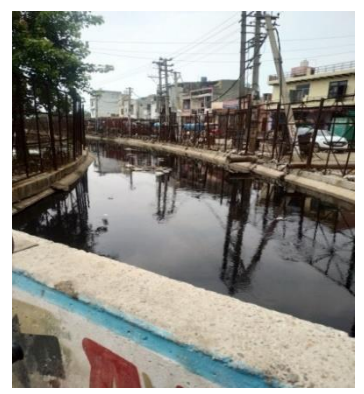
Figure 2: Untreated wastewater in Canal is flowing through the city

There are 11 intermediate sewage pumping stations and 3 main pumping stations<sup>7</sup> with 3 STPs in the city having an installed treatment capacity of 140 MLD (KII-8, 2020; KII-9,2020). The STPs are based on UASB and SBR technology. As per the current scenario, ~60% of the wastewater is reaching to the STPs<sup>8</sup> (W4a, S4d) considering the leakages from old defunct sewer lines which finds its way to either open drains, canal or River Yamuna (KII-5, 2020). There are 2 main nallahs in the city namely Budhiya nallah & Gaunchi nallah<sup>9</sup> that ends up directly flowing into river Yamuna. While, all open drains in the city are tapped and diverted into sewer line (KII-4,2020) but that also ends up in open canals to River Yamuna (Field observation; KII-5, 2020; FGD-2, 2020). Presently, around 117 MLD is reaching to the inlet of STP out of 197 MLD of total water supply (247 MLD) which is in compliance to total treatment capacity of 140 MLD. Therefore, varaibale W4a & S4d is considered 60% in SFD matrix.