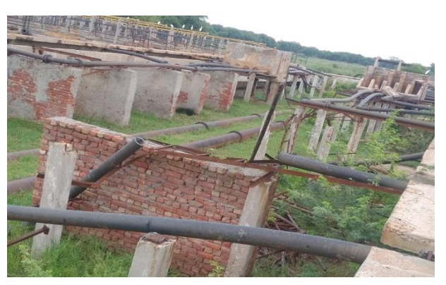
Figure 1: Pratapgarh STP

The sewerage network has been laid in the city within the administrative boundary of Faridabad with total 638 km of sewerage network which accounts for 30% city's population<sup>6</sup> (Field Observation; KII-2, 2020; KII-3, 2020) but wards pipelines are under repair. Rest 70% of city's population is dependent on hybrid system of onsite containment systems (OSS) a Septic tank and fully lined tank, whose outlet is connected to sewer lines & open drains respectively (Field Observation; FGD-1, 2020; FGD-2, 2020)