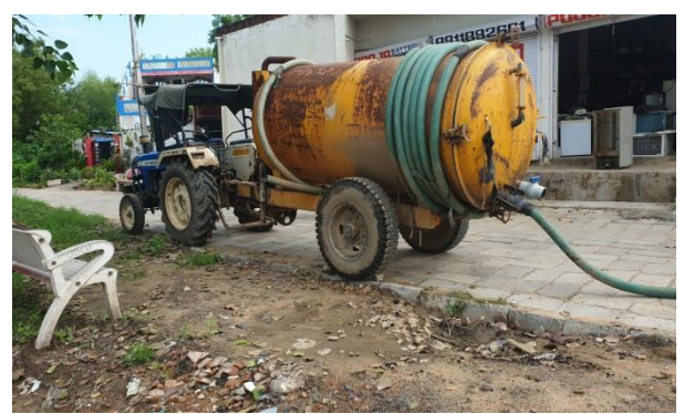
Figure 10: Private Vaccum Tankers

Transportation: septage The emptied is transported through the tractor mounted vacuum tankers. The average time taken to dispose emptied septage is around ~30 minutes (FGD-2, 2020). Around 5 to 6 trips per day are made by each vehicle (FGD-2, 2020). The faecal sludge (FS) emptied by Govt/ private operated vacuum tractors is discharged into designated disposal sites/nallahs instructed by Faridabad Municipal Corporation while private operators discharged Faecal sludge either in open fields or ground (FiledObservation; FGD-2, 2020). Therefore , the variable F4 is considered 54% in SFD matrix.