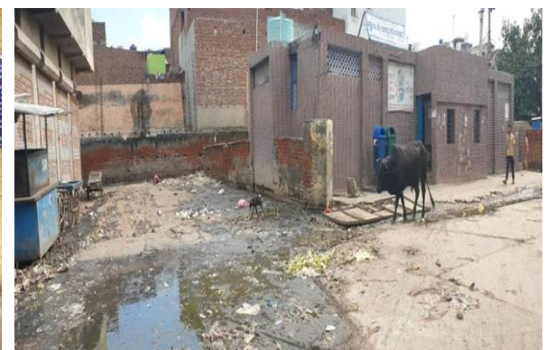
Figure 6: PT near Sabzi Mandi in Ballabgarh

As per 2011 census, 9% of the population was defecating in open but Municipal Corporation Faridabad has constructed PT/CTs & individual household laterines(IHHL) 15687<sup>11</sup> in numbers across the city especially for Below Poverty Line (BPL) near low income settlements and as a result, the city has achieved ODF status<sup>12</sup> on 02/08/2019 (KII-6, 2020; KII-7, 2020). Under SBM, there is a proposal for the new construction of 47 (CT) and (80) PT<sup>13</sup> in the city (KII-7, 2020). However, people living in slums and low income settlements are resorted to defecate in open due to poor accessibility & infrastructure or lack of maintainence in toilets (Field Observation; FGD-3, 2020)