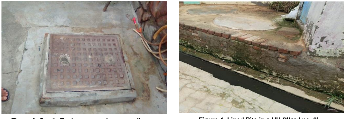
Figure 3: Septic Tank connected to sewer line in Ward no. 4

Containment: Based on sample household survey, KIIs and FGDs with relevant stakeholders, it was concluded that 70% population is dependent on the On-site Sanitation Systems (OSS) (Field Observation; KII- 4, FGD-1, 2020; FGD-2, 2020). The containment systems prevalent in the city are septic tank (ST) connected to centralised foul/separate sewer (T1A2C2, 20%), fully lined tank (FLT) connected to centralised foul/separate sewer (T1A3C2, 20%), fully lined tank (FLT) connected to open drain or storm sewer (T1A3C6, 20%), Lined tank with impermeable walls and open bottom, no outlet or overflow (T1A4C10, 5%) and Lined pit with semi-permeable walls and open bottom, no outlet or overflow (T1A5C10, 5%) (Field Observation; FGD-1, 2020; FGD-2, 2020).