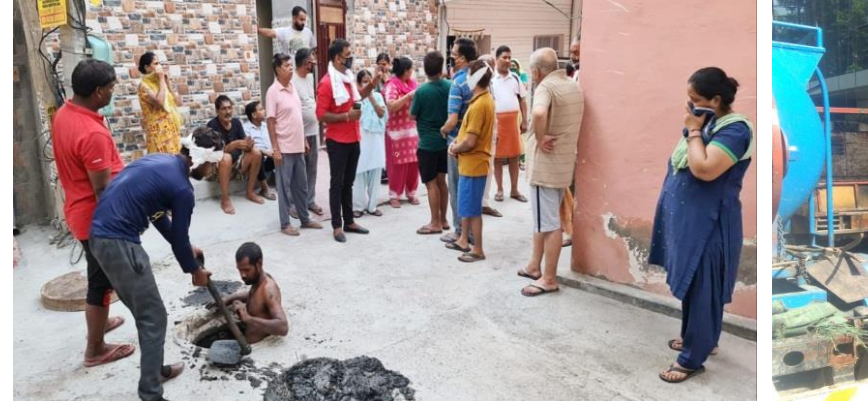
Figure 8: Manual scavenging in ward no. 17

There are no charges by Govt operated vacumm tractors whereas private operators charge the varying fees from INR 500-1000/ trip based on property type & containment size (FGD-2, 2020). The desludging services for the public and community toilets is carried out periodically by the service providers of Faridabad Municipal Corporation and hence are free of cost (FGD-3, 2020). All the emptying vehicles are maintained properly by Faridabad Municipal Corporation at the designated depot (Field Observation). The emptiers are not provided with Personal Protective Equipments (PPEs) for carrying out safe emptying services (FGD-3, 2020)